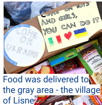
Food was delivered to the gray area - the village of Lisne