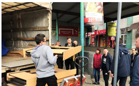
Beds for children, pensioners and the disabled were assembled in the subway to prevent sleeping on cold concrete