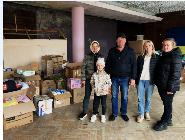
For territorial communities of Kharkiv and other territorial regions