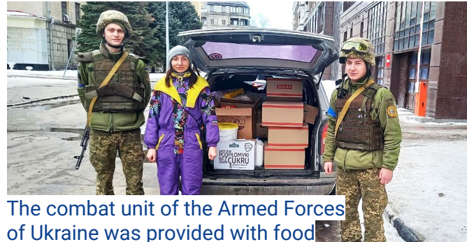
The combat unit of the Armed Forces of Ukraine was provided with food