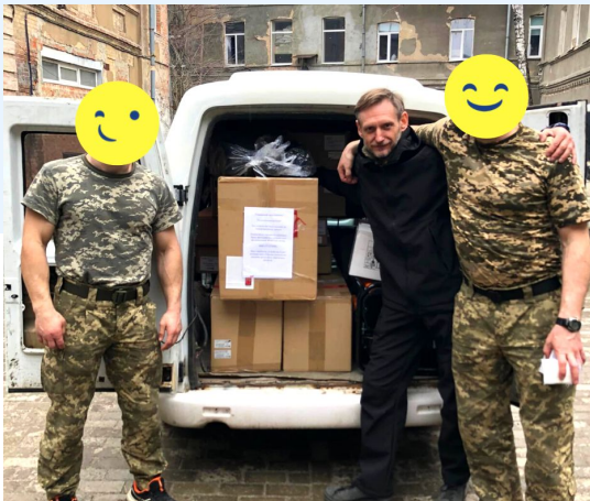
For the units of Armed Forces , Territorial Defense Forces and National Guard of Ukraine