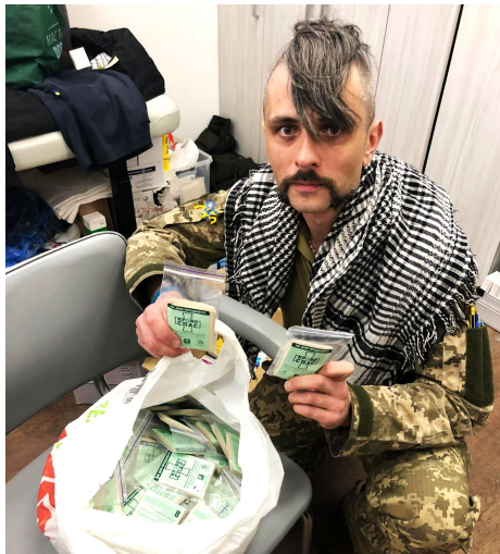
Two of our Territorial Defense units have received 200 individuals packs for quick blood stop