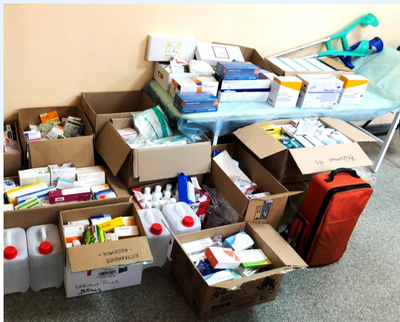
For medical institutions