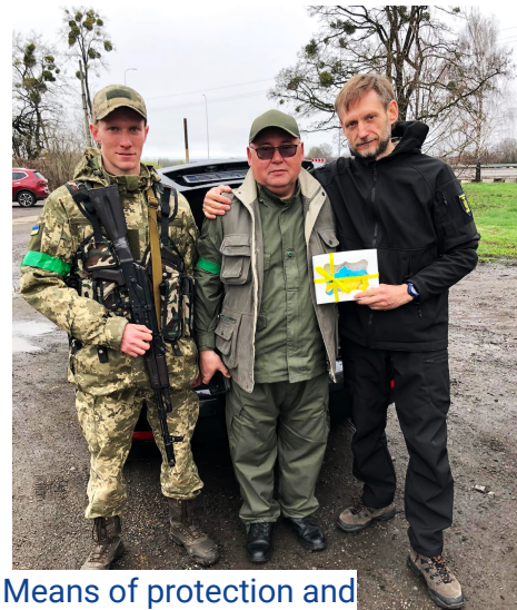
Means of protection and paramedics were delivered for the Armed Forces of Ukraine