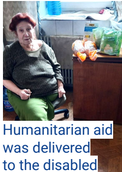
Humanitarian aid was delivered to the disabled