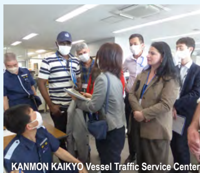
KANMON KAIKYO Vessel Traffic Service Center