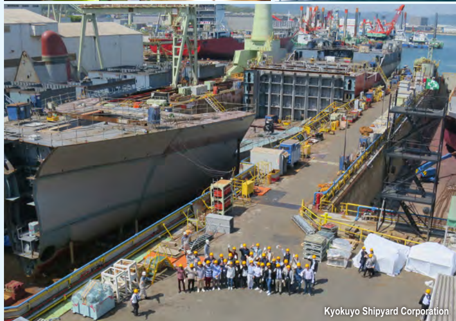
Kyokuyo Shipyard Corporation