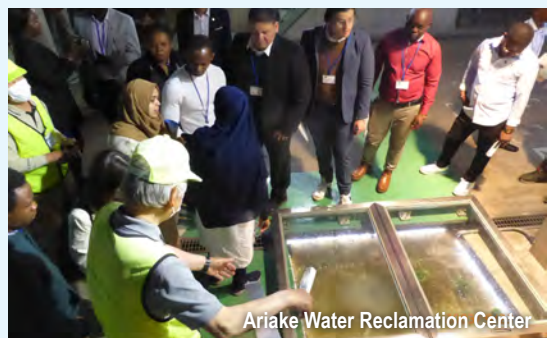
Ariake Water Reclamation Center