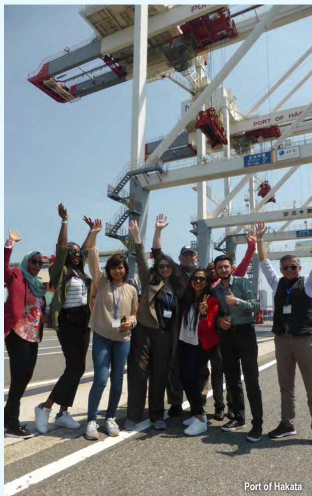
Port of Hakata