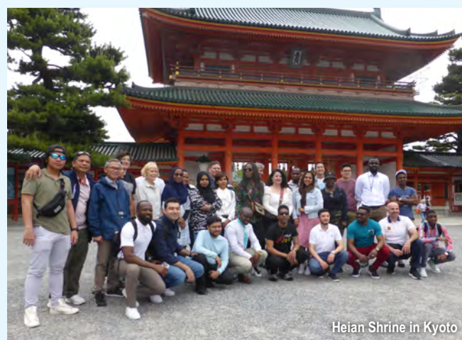
Heian Shrine in Kyoto