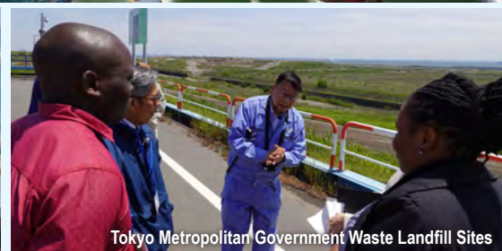
Tokyo Metropolitan Government Waste Landfill Sites