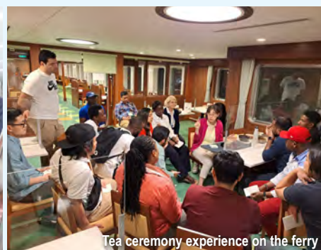
Tea ceremony experience on the ferry