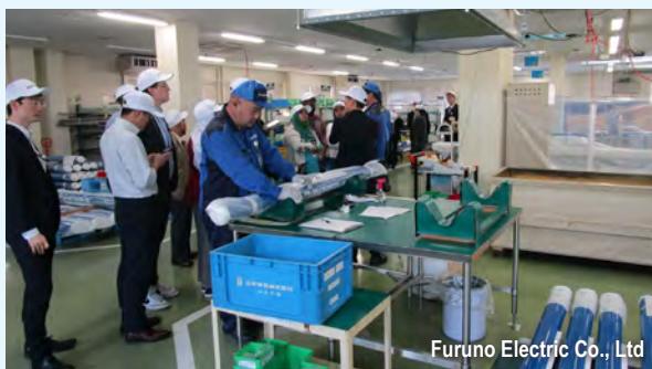
Furuno Electric Co., Ltd