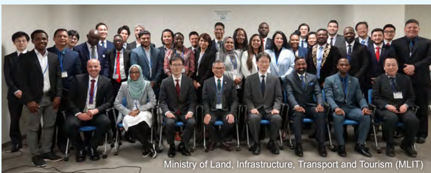
Ministry of Land, Infrastructure, Transport and Tourism (MLIT)

Next was a courtesy visit to The Nippon Foundation where we had the honour of a personal meeting with Dr. Yohei Sasakawa, Chairman of The Nippon Foundation. The students were each introduced to Dr. Sasakawa and they thanked him for the fellowship support they had received, outlining briefly how their studies at the World Maritime University would benefit the maritime industry in their home countries and regions. The group then sang the WMU Song for Dr. Sasakawa, which he seemed to enjoy, conducting us from his place on the podium. Dr. Sasakawa responded with a warm personal address, and we were then delighted take both group and individual photographs with him. The positive energy Dr. Sasakawa displays is an inspiration to us all.