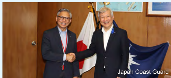
Japan Coast Guard