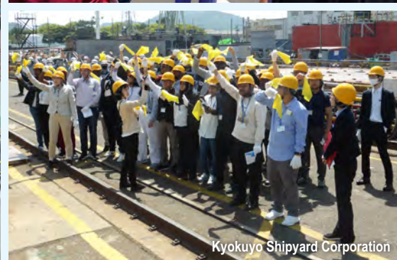
Kyokuyo Shipyard Corporation