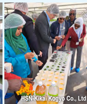
HSN-Kikai Kogyo Co., Ltd