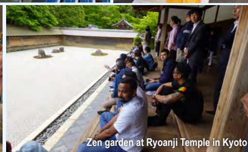
Zen garden at Ryoanji Temple in Kyoto

is now one of the major suppliers of marine radar equipment – and since my return to Sweden I have enjoyed spotting Furuno equipment on boats moored near my home. I know where it came from!