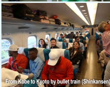
From Kobe to Kyoto by bullet train (Shinkansen)