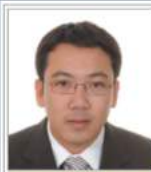
Viet Nam 8029 MET

I'm forever grateful for the privilege and kindness of Nippon Foundation granting me the WMU Sasakawa Scholarship Award. I'll do my best to muster all the learning and insights in store for me at WMU. In return, contribute for the betterment of my country and the world in general to make it a safer, cleaner and better place to live.