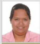
Philippines 8051 MET