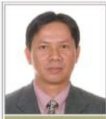
Philippines 8067 MET