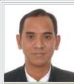
Thailand 8003 MET