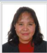
Philippines 8086 MLP