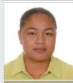
Tonga 8065 MLP