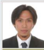
Viet Nam 8032 MET

"My admission to the World Maritime University through a Sasakawa Fellowship is an extra ordinary opportunity. After completion of my studies, I shall ensure that the learnings I would gain shall be shared to my fellow maritime trainers and to the Filipino seafarers whom we train at the National Maritime Polytechnic, the only government maritime training center in the Philippines."