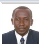
Tanzania 8074 MLP