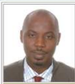
Nigeria 8054 PM

Having this opportunity to study in The World Maritime University through Sasakawa Fellowship is the beginning of the journey toward success. Acquiring Knowledge and skill on Maritime Affairs will keep me up to date, and be fruitful to myself, my Government as well as Sasakawa fellows around the world.