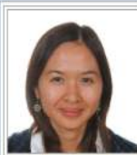
Viet Nam 8060 SM

Thanks Nippon Foundation. Upon graduation, I look forward to go back to my country where I can be directly involved in the formulation/redefinition of our domestic maritime policies that will effectively respond to current and future global maritime challenges. I hope that the friendship our batch will forge will be translated into a broader perspective of international cooperation and understanding.