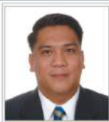
Philippines 8090 MEOM