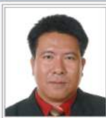
Philippines 8061 MLP

"I have the honour to show my appreciation by saying thank you very much to The Nippon Foundation and OPRF for their kindness to fund my studies at the WMU. This opportunity I will fully utilise to achieve my goal by improving my knowledge on international maritime conventions and policies and it will be a benefit for myself and my country."