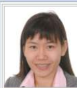
Viet Nam 8026 PM

It is said that knowledge is the best weapon one can possess because it can change lives and even the course of the world. The opportunity to study at WMU is an opportunity to gain needed knowledge that students from participating countries may use for the benefit not just their countries but the world. This is now given me through Mr. Sasakawa's kindness.