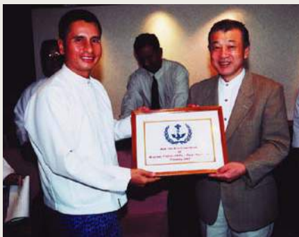
A memorial plate was presented to Mr. Sasakawa

We in Myanmar salute benefactors such as he; for his generosity has had direction, insight and the vision we all of us share - a better world through education.