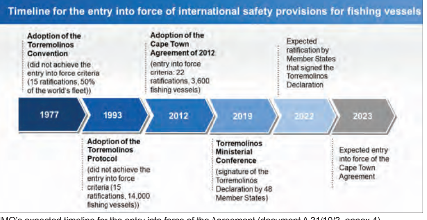
IMO's expected timeline for the entry into force of the Agreement (document A 31/10/3, annex 4)