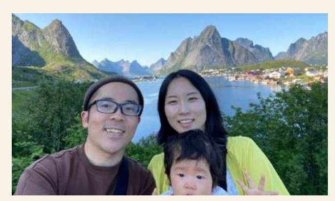
Family photo with a beautiful Fjord backdrop

It wasn't just my Norwegian friends who gave me a warm reception; the great nature of Norway welcomed me and my family with open arms. As you may already know, Norway is a country with