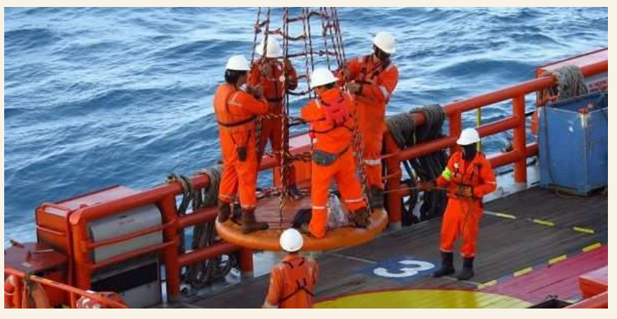
Seafarers working onboard.

The resources allocated for the security, safety, wellbeing, development, and rights of people engaged in the maritime industry, especially sea-