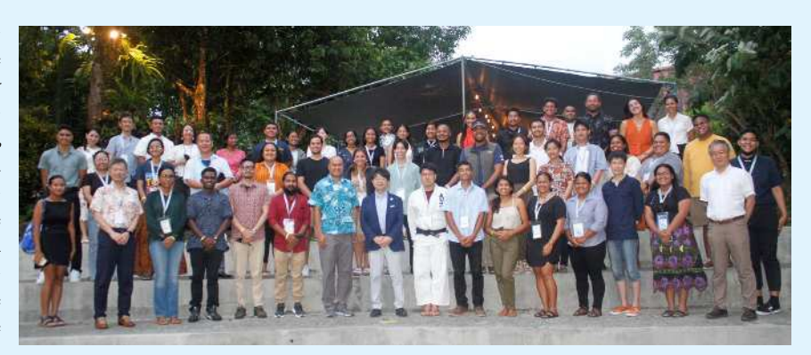
Youth Leadership Summit participants together with members of the Sasakawa Peace Foundation.

This OOC held in Palau was unique in three ways: 1) Balancing economic recoveries from the COVID-19 and ocean conservation; 2) Climate crisis measures and actions that utilize the ocean and the coast; and 3) The presence of youth leaders. For small island states and developing coastal countries, where ocean-based tourism and fisheries are important sources of income, the impact of the prolonged pandemic on tourism has worsened the economic situation, and discussions were centered on how to increase production from the sea to protect people and their livelihoods, as well as preserving the ocean. The phrase "protect, produce,