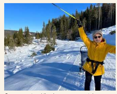
Cross-country skiing in snowy mountains

In May 2020, in the middle of the COVID-19 pandemic, I moved from Tokyo to Oslo. This was when I started my life as a diplomat in the Japanese Embassy in Norway, with Oslo becoming my second Nordic hometown after Malmö, Swe-